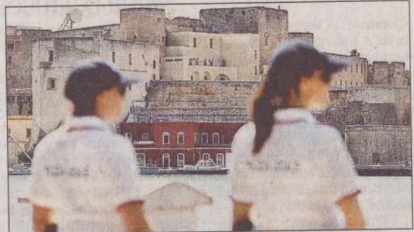
A view of Castello Federiciano in Italy, the venue where the G7 summit's first dinner is scheduled to take place on June 13

Asked about the focus on Russia-Ukraine conflict, Kwatra said India has always maintained that dialogue and diplomacy is the best option. He recalled Modi's remark in Sep 2022 before Russian Presi-