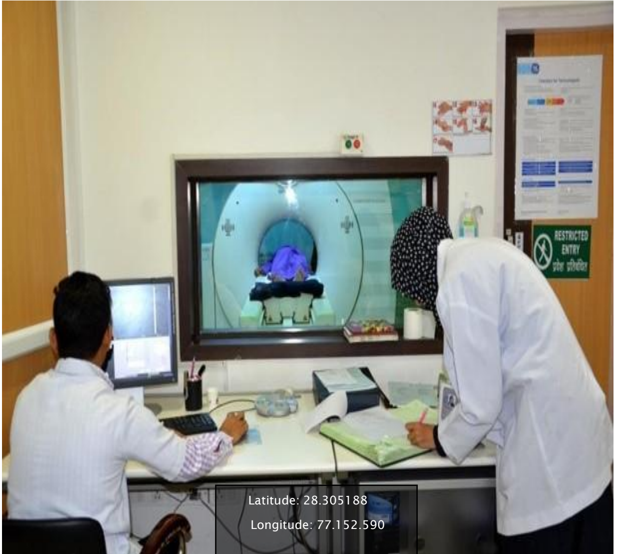
HIMSR IMAGING CENTER JAMIA HAMDARD