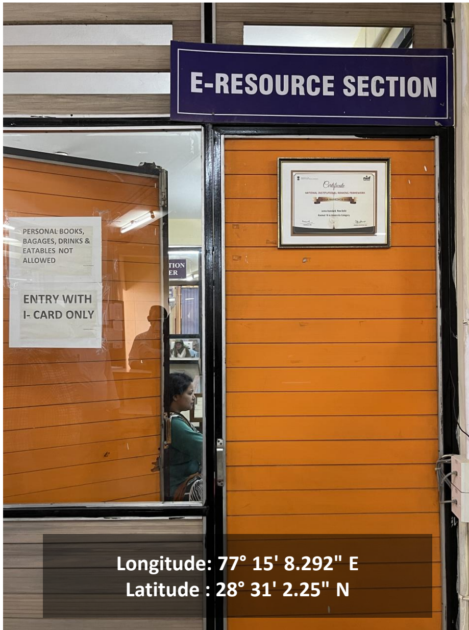
E-RESOURCE SECTION, HMS CENTRAL LIBRARY JAMIA HAMDARD