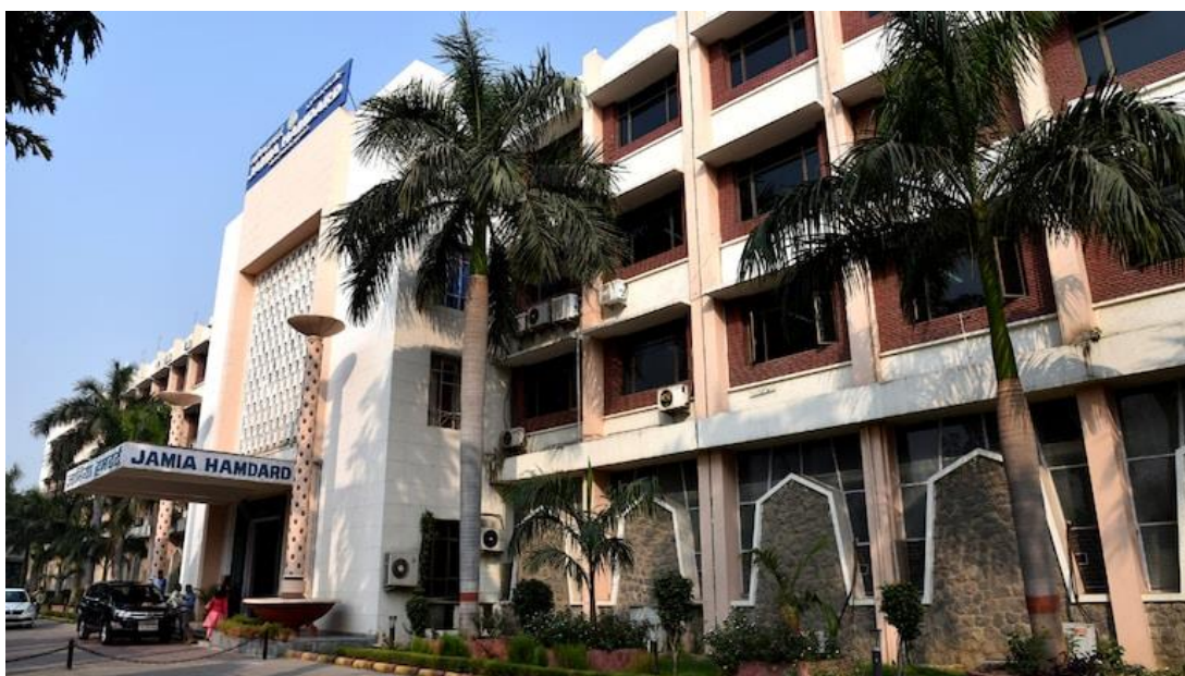
SCHOOL OF CHEMICAL AND LIFE SCIENCES Department of Chemistry